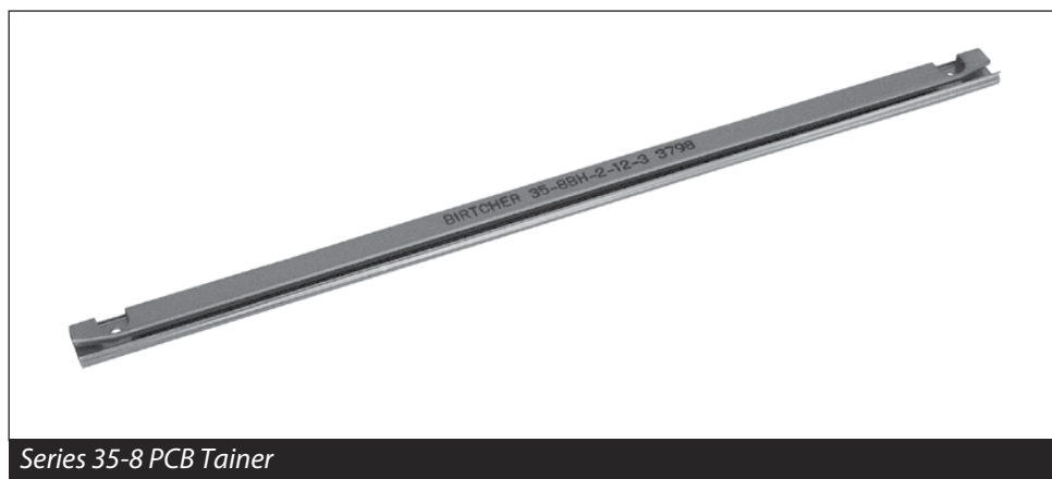
Series 35-8 PCB Tainer